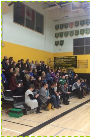
PEC Forum Crowd

This is a free event but tickets are limited so please contact Sheldon Dahl at sjdahlmail@gmail.com to reserve yours.