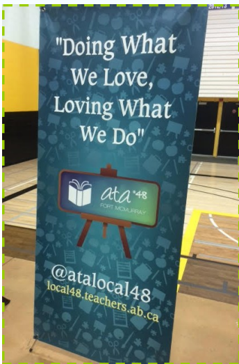
Local 48 Banner