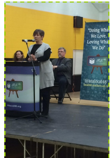
PEC Forum March 7th

There are two PD grants available for cycle two. Teachers may submit their applications to local48PD@gmail.com .